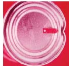
Sharp Lid Dent