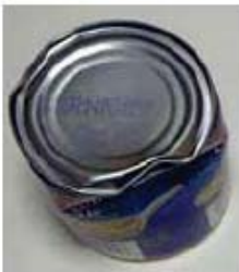
Dent at Side and Top