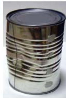
Dent on Seam