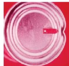
Sharp Lid Dent