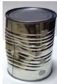
Dent on Seam