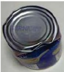
Dent at Side and Top